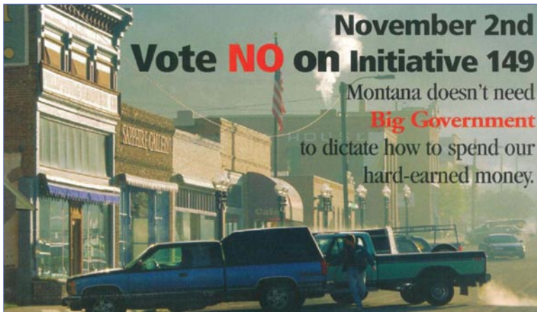
Advertisement from Montana veterans, taxpayers, and tobacco retailers, wholesalers, and manufacturers against Initiative 149 campaign

the measure, the tobacco industry decided not to oppose the initiative. By election day, the tobacco industry had spent $112,000 to defeat Amendment 35 compared with $2.03 million spent by health advocates to enact the initiative. 33